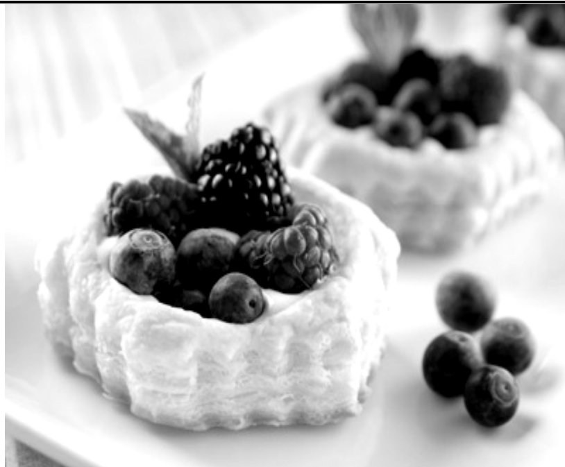
B. PASTRY CASE

4.1.1 Compare PASTRY A and PASTRY B under the following headings: